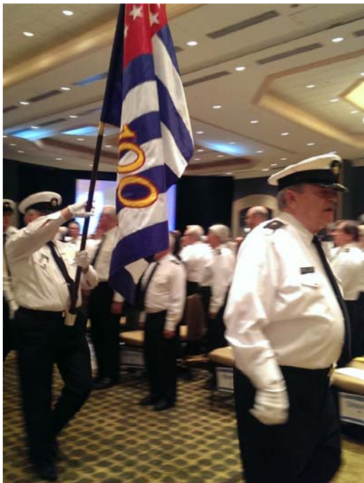
The retiring of the 100th Anniversary Ensign