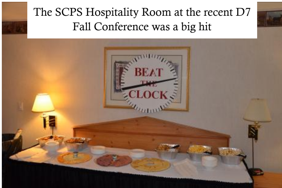
The SCPS Hospitality Room at the recent D7 Fall Conference was a big hit