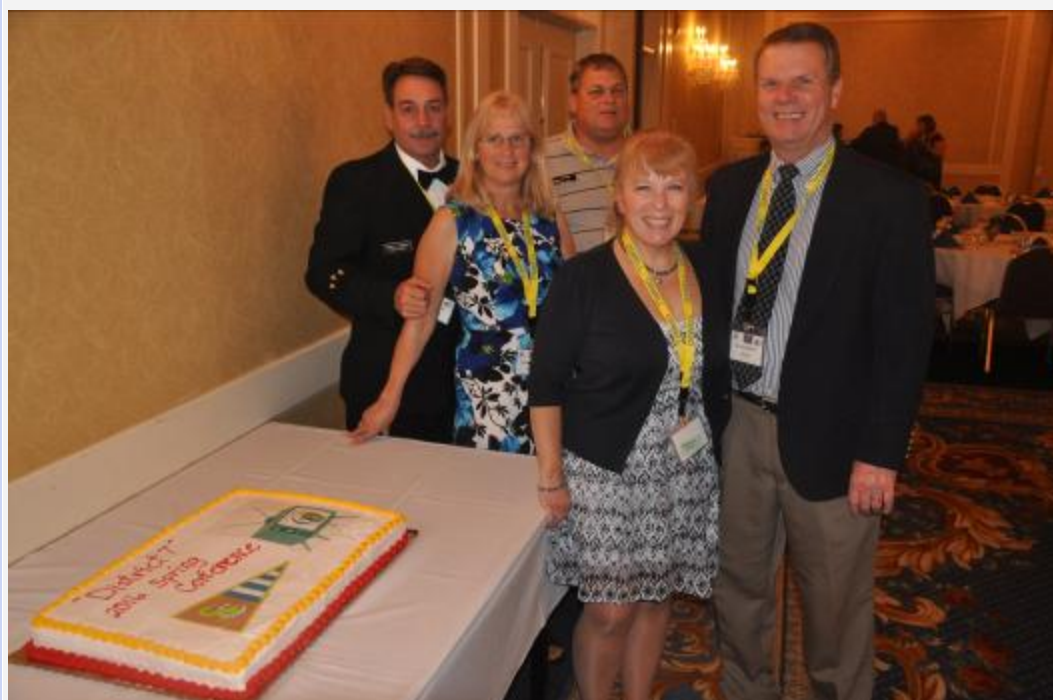
Members of the SCPS Conference Committee enjoying the Saturday evening dinner.

To all, have a great and SAFE boating Season!