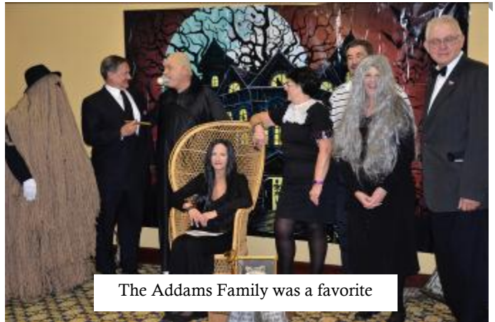
The Addams Family was a favorite