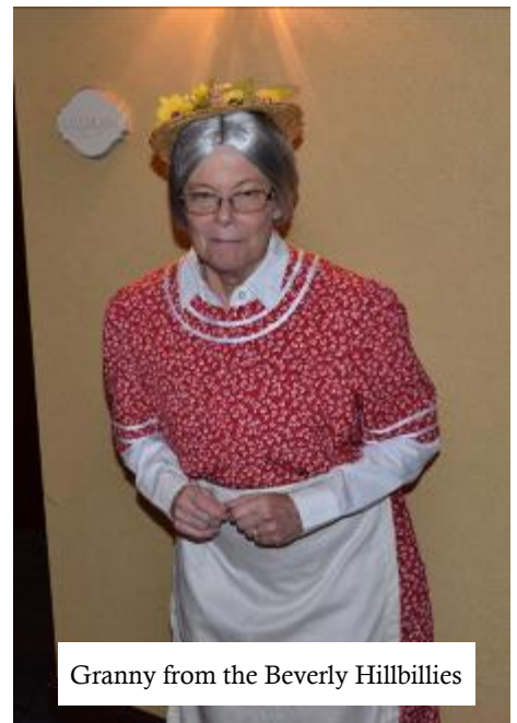
Granny from the Beverly Hillbillies

D7 Spring Conference Hospitality Rooms were very well attended