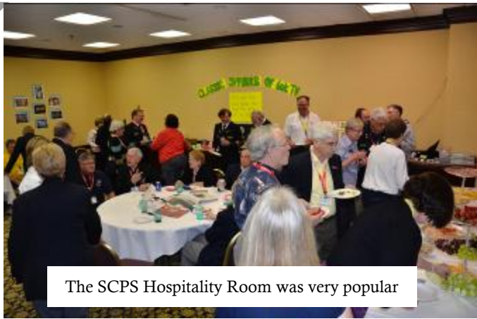
The SCPS Hospitality Room was very popular