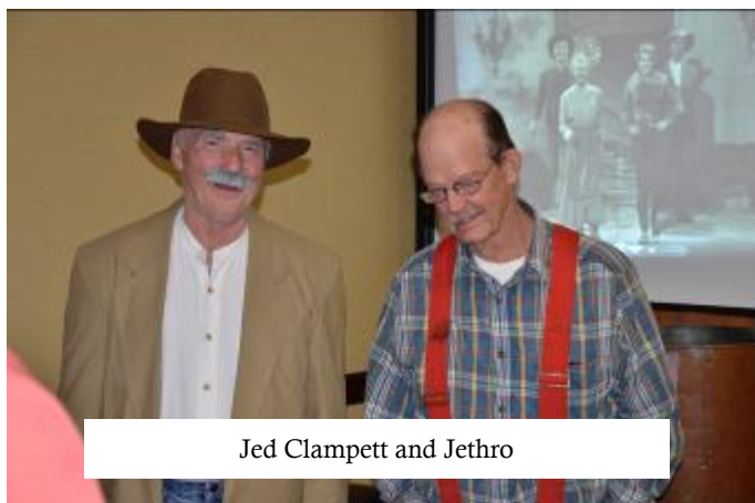
Jed Clampett and Jethro